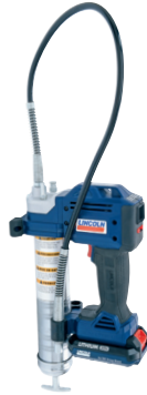
20 V Li Ion PowerLuber Model 1882-E

Lincoln's PowerLuber family includes a full range of battery-operated grease guns, including NiCad and Lithium-Ion-powered tools, as well as pneumatic and electric options. Developed by the lubrication experts, the PowerLuber line has the right grease gun for your needs.