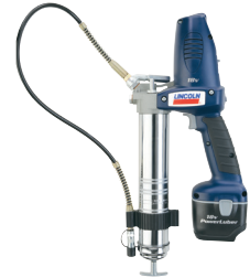
18 V NiCad PowerLuber Model 1842-E