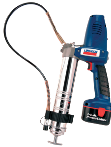
14 V PowerLuber Model 1442-E