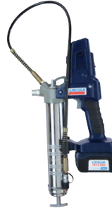
18 V Li Ion PowerLuber Model 1862-E