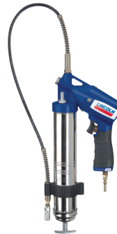
Pneumatic PowerLuber Model 1162